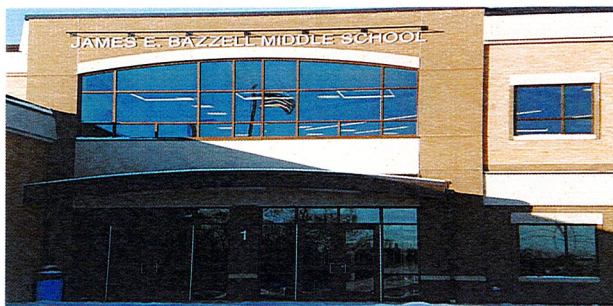
James E. Bazzell Middle School