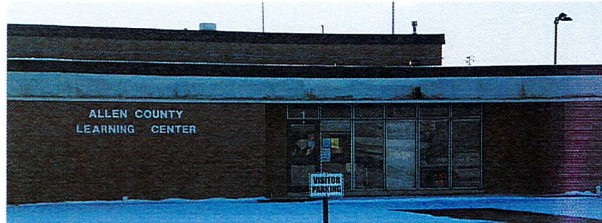
Allen County Learning Center