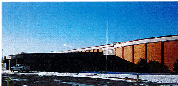
Allen County-Scottsville High School