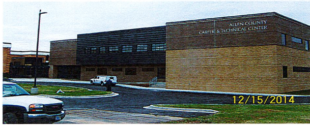
Allen County Career & Technical Center