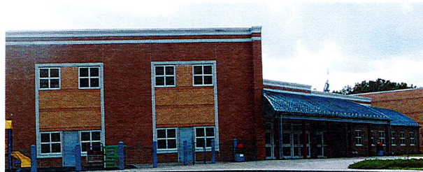
Allen County Primary Center

The School Breakfast program was established in 1966. Studies confirm that students who eat breakfast work faster, behave better, are more creative and make fewer mistakes. They score higher on tests, miss fewer days, improve attention spans and develop better social skills. Classroom attention, attendance and achievement are all improved by breakfast participation. All schools offer nutritious choices for breakfast that meet the USDA Nutritional Guidelines.